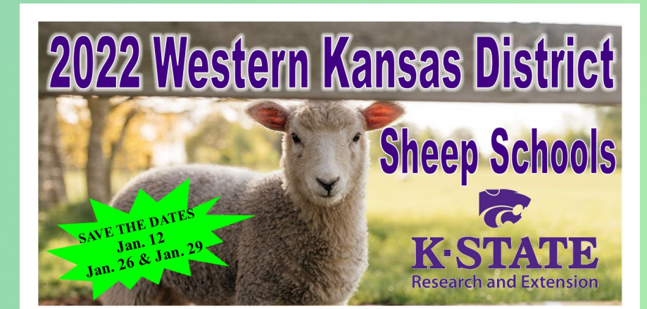
Meeting Details, Topics & Speakers Coming Soon

2022 Virtual Zoom Sessions Wednesday, January 12<sup>th</sup> & Wednesday, January 26<sup>th</sup>